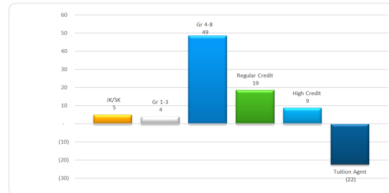
Changes in Enrolment: Actual v Budget