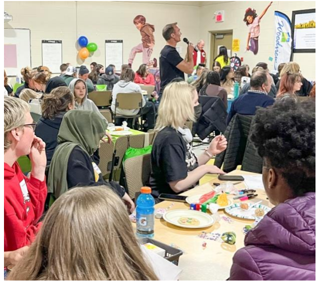
Above: Students take part in a Wellness Out Loud workshop at the April 18 event at Joseph Brant Learning Centre.