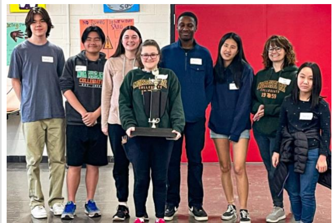
Above: Students from North Park Collegiate and Vocational School celebrate an overall win at the inaugural Grand Erie Math Team competition.

Thank you to Hagersville Secondary for hosting the competition, and to all the students that performed so well throughout the day. The overall team winner of the day was North Park Collegiate and Vocational School.